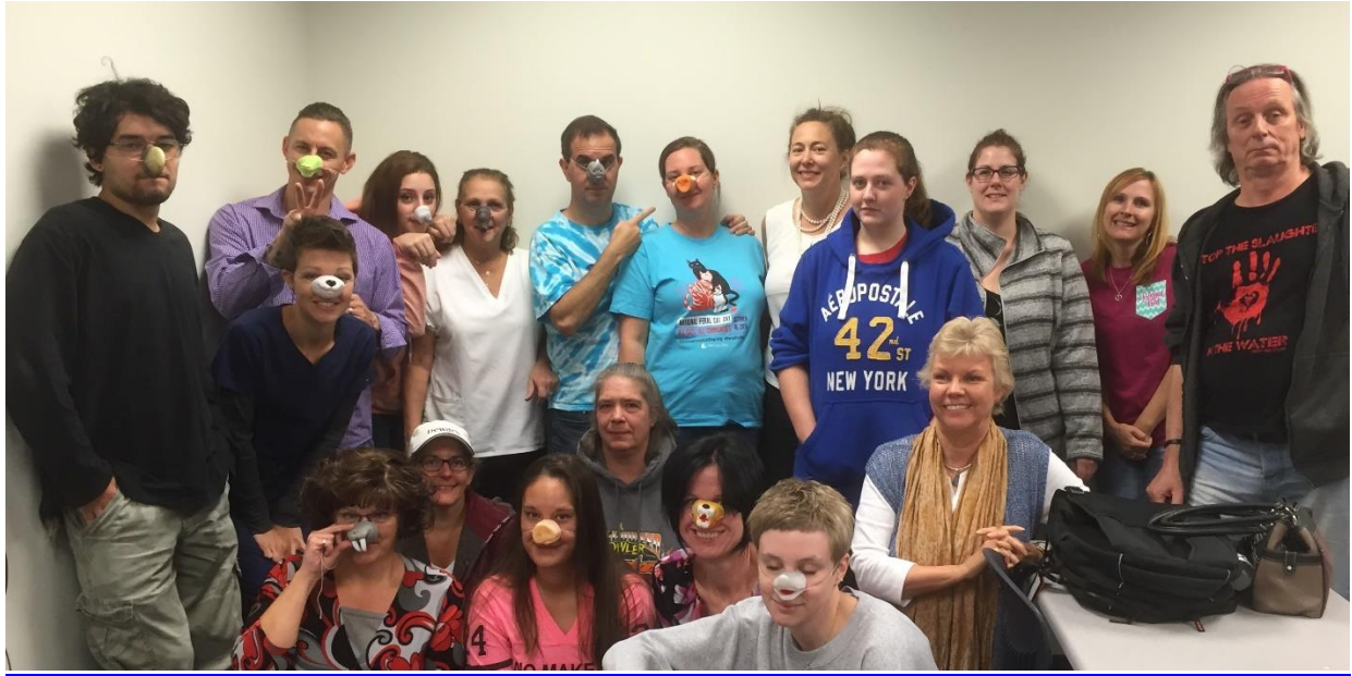
“Zoo-noses” in the Fall Wildlife Rehab class at Forsyth Tech!